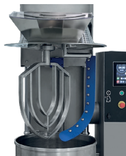
Paddle and scraper included